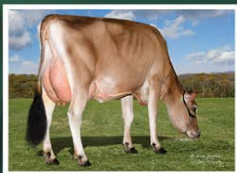
Dam of JX Chic {6}